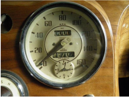
2000 number on the scale 860